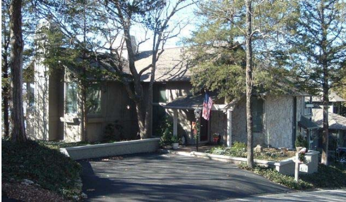
474 Moongate Drive